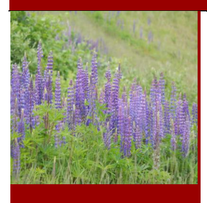
"Start by doing what's necessary; then do what's possible; and suddenly you are doing the impossible" ~Francis of Assisi