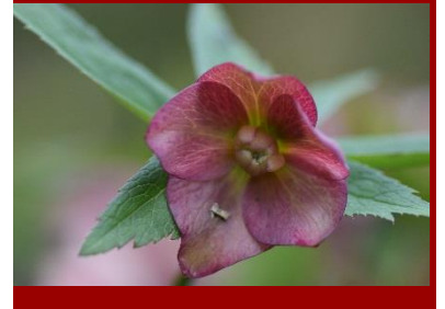
"To the mind that tis still, the whole universe surrenders